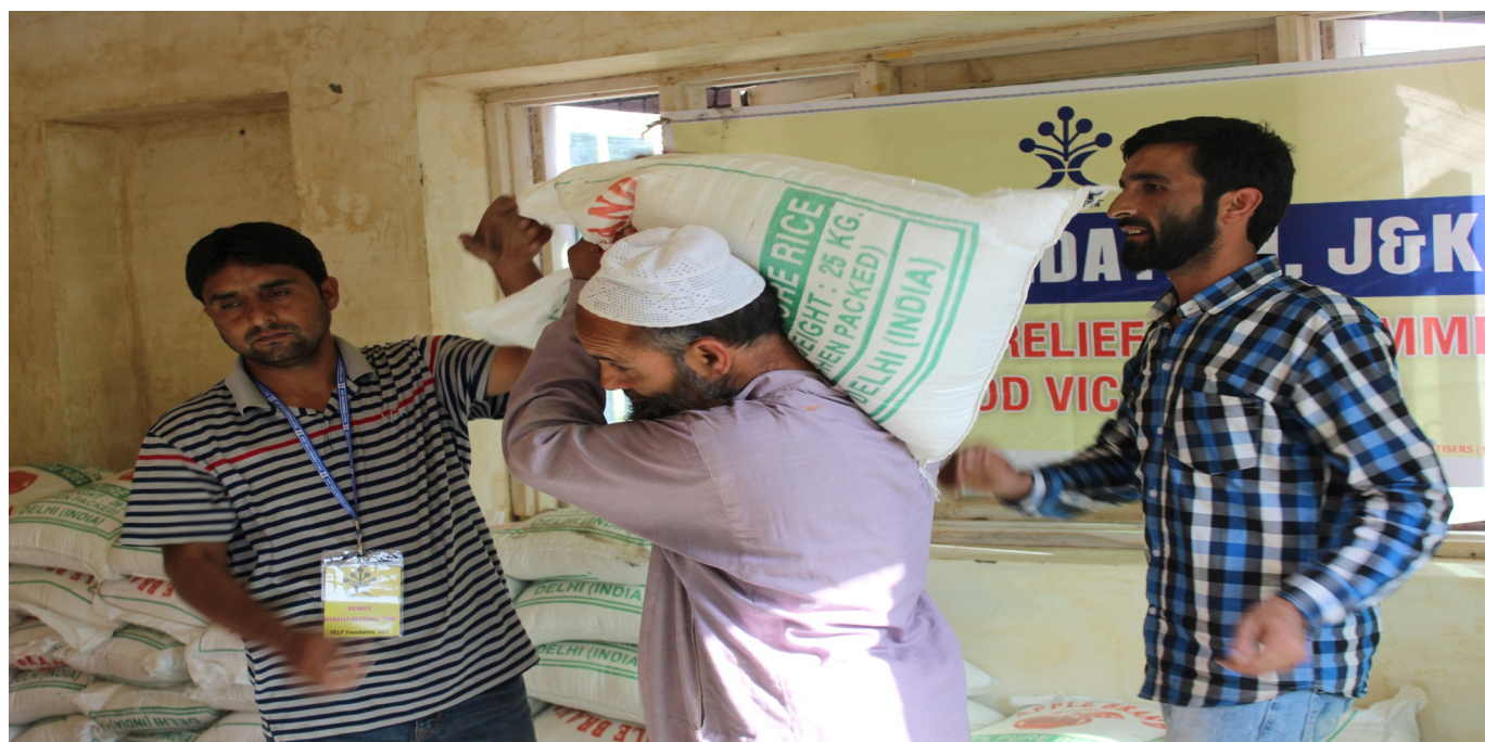
Beneficiary receiving Food pack at Hyderpora Centre, Oct-2014