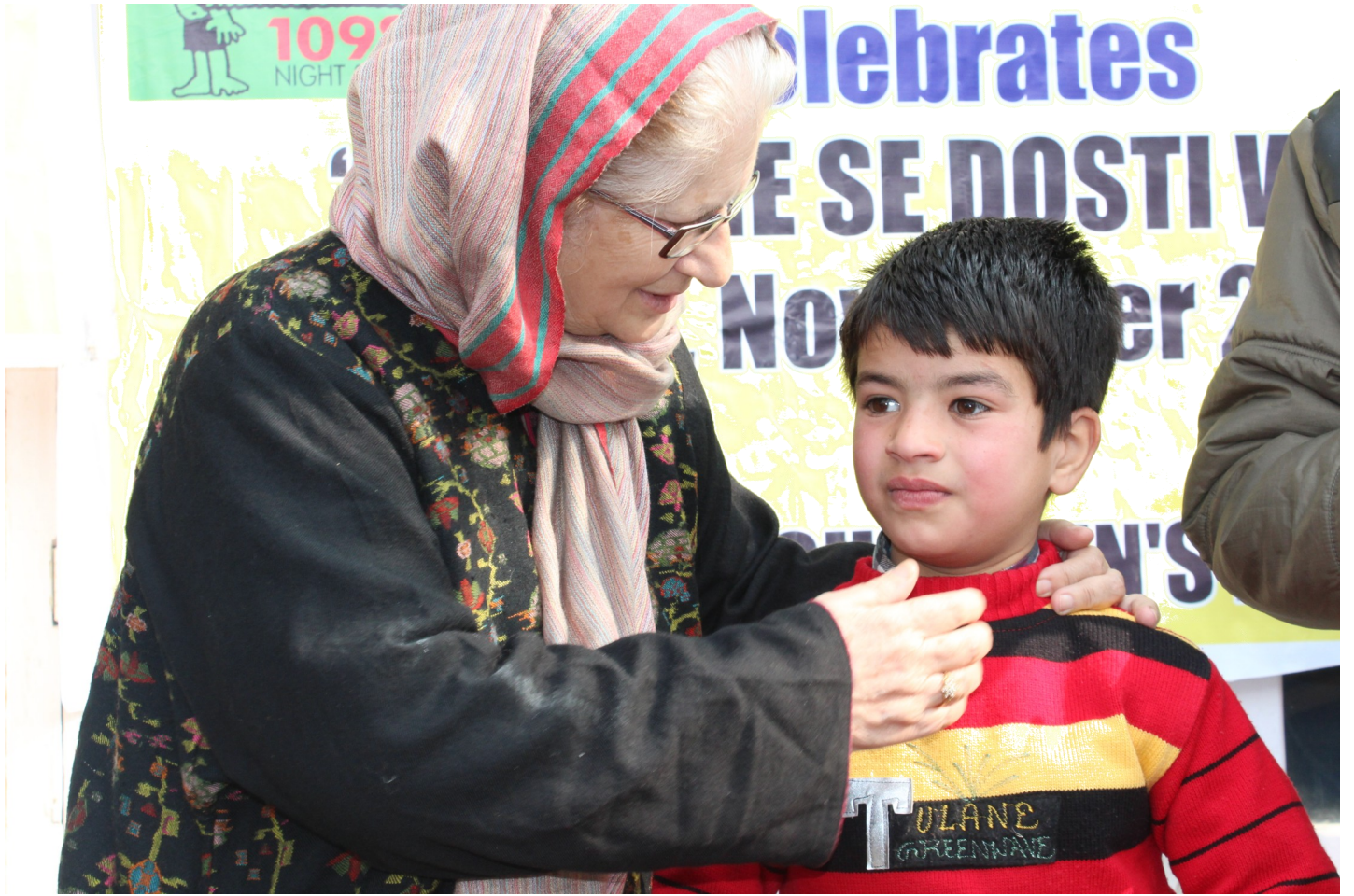
More than 100 children received study materials through CHILDLINE Srinagar.