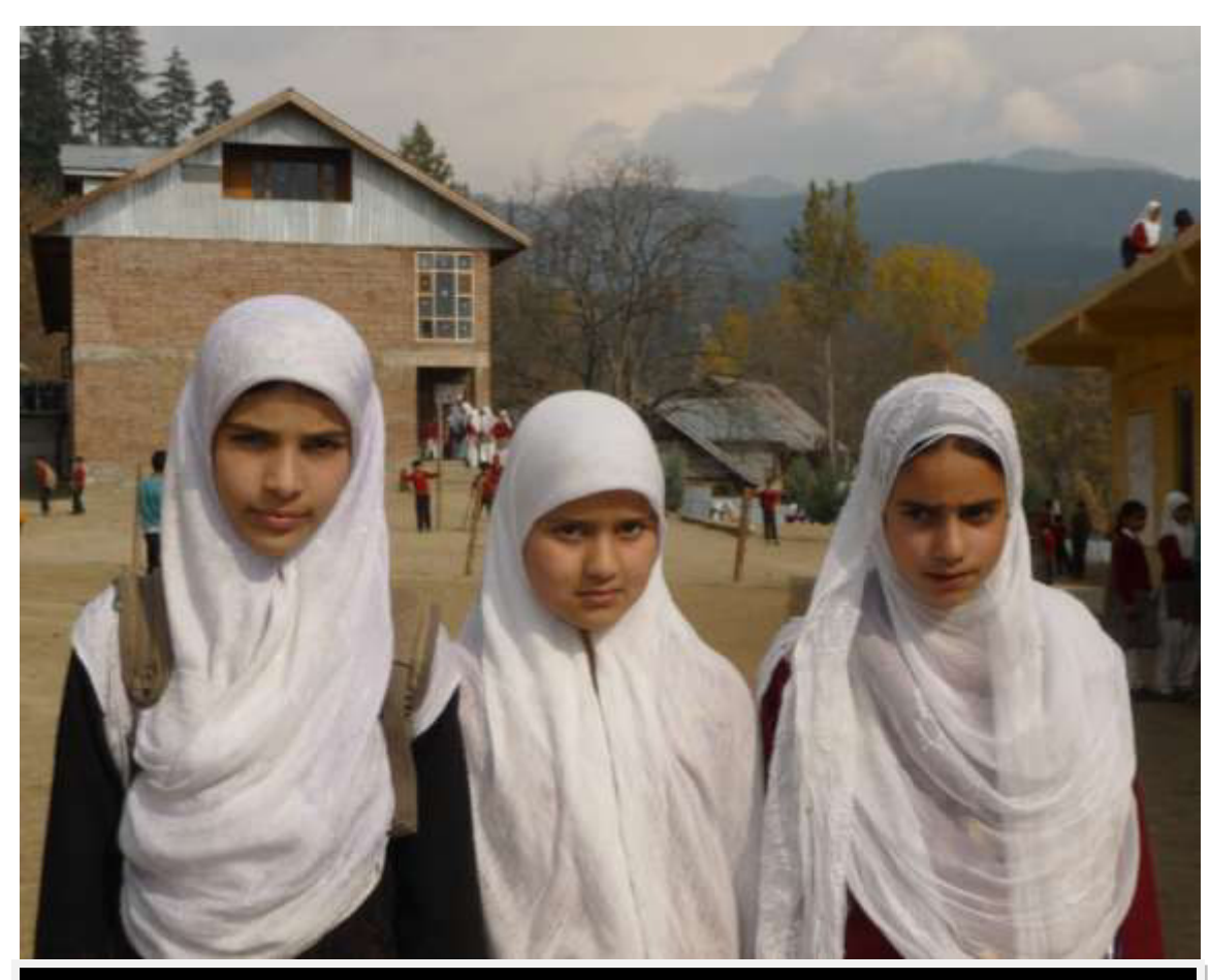
Three, uniformly dressed, Special Girls at Shah Anwar Memorial secondary School, Khumriyal, Kupwara