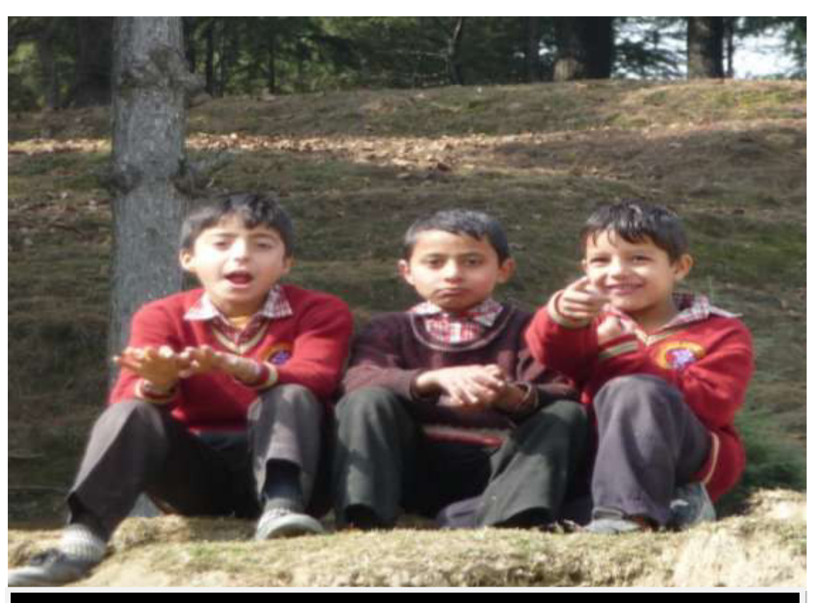
Three smiling faces of Shah Anwar Memorial Secondary School, Kupwara, enjoy lunch time under shades of pine.